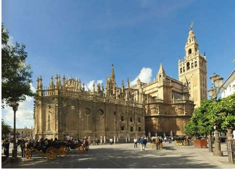
Catedral y Giralda de Sevilla