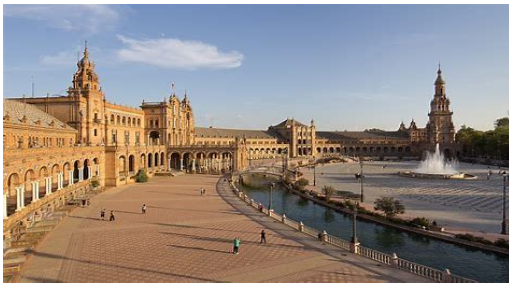
Plaza de España