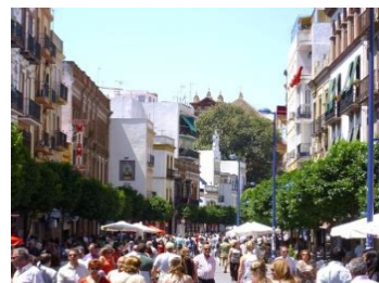
Barrio de Triana