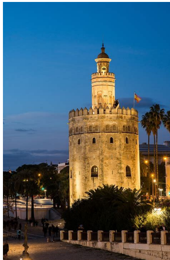
Torre del Oro