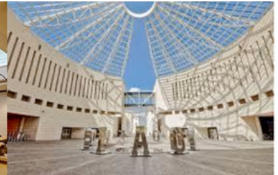
MART - Museo d'Arte Moderna (Rovereto)

Useful tips on how to spend the weekend and useful links can be found here .