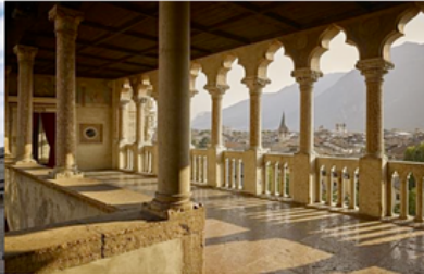
Castello del Buonconsiglio