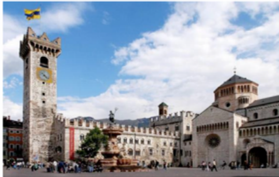
Piazza Duomo e il Duomo di Trento